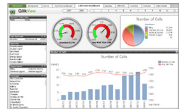
Visually rich, interactive dashboards

“With QlikView, I can analyze data in a way I could only dream about before.”